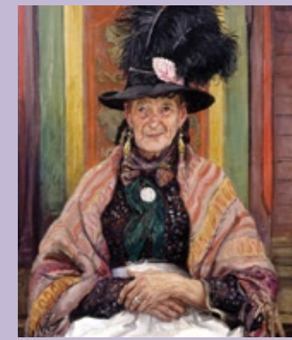
Gypsy Salembour, Dame Laura Knight

Previous exhibitions have included Andy Warhol, British Art Show and Waking Dreams a collection of pre-Raphaelite masters.